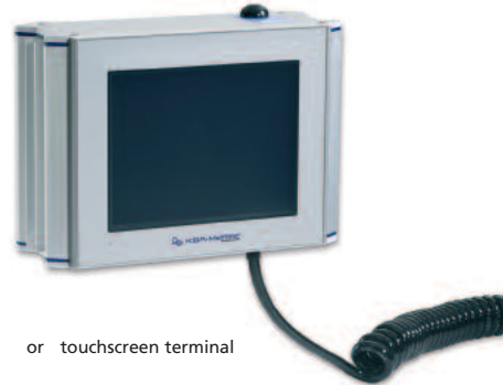
or touchscreen terminal

The K-1010 SP/K-1030 SP laser systems are ideal for product marking with pinpoint-sharp texts at minimal operating costs.