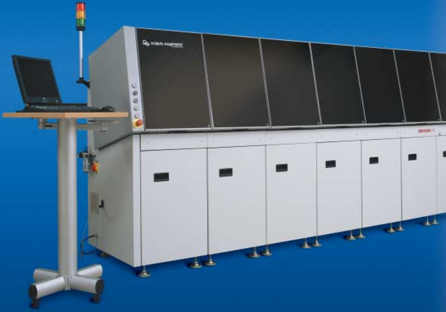
Universys with seven modules ready for operation

Despite its complexity, the Universys is very easy to operate. Operators use well-designed screen forms on the display to recall all of the job-specific parameters. The user is guided through