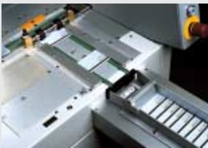
Delivery module with reject shunt

Despite its complexity, the Universys is very easy to operate. Operators use well-designed screen forms on the display to recall all of the job-specific parameters. The user is guided through