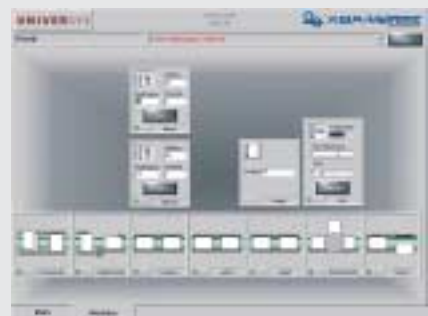
Operators control all Universys machine functions from a simple, user-friendly display.