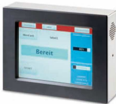
Touch Panel (optional)